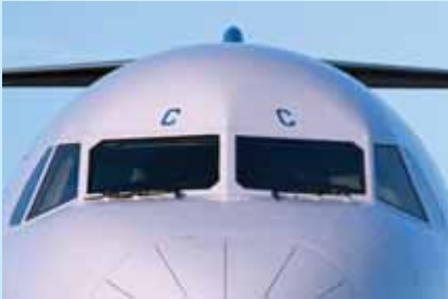
Fokker 100 MSN 11334 28 February 2008 Skywest Airlines (VH-FNC) Western Australia, Charter Operations